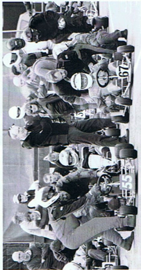
Classic class ones.